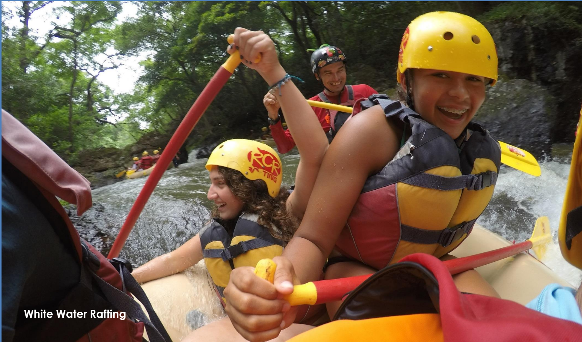
White Water Rafting