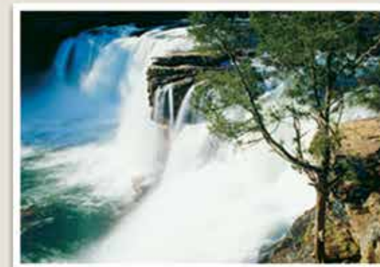
Little River Falls