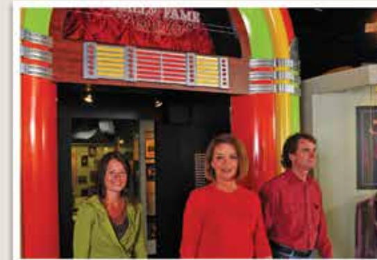
Alabama Music Hall of Fame