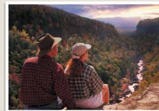
Little River Canyon