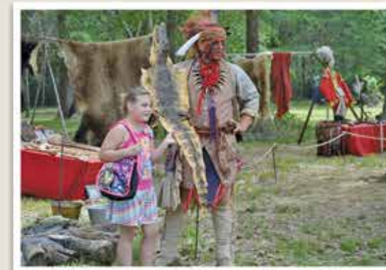
Oakville Indian Mounds Park & Museum