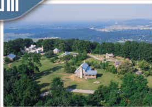
Burritt on the Mountain

745 Constellation Place Drive SW, Huntsville, Ala.; (256) 512-0188.