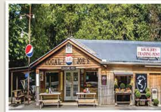
Local Joe's Restaurant