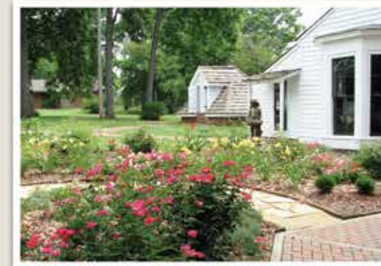
Helen Keller Home