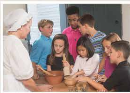
Alabama Constitution Hall Village