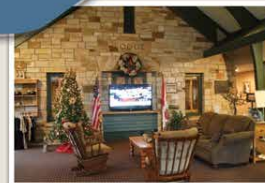
DeSoto State Park lodge

4967 Rainbow Dr, Rainbow City, AL 35906-8607