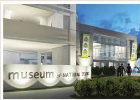
Cook Museum of Natural Science