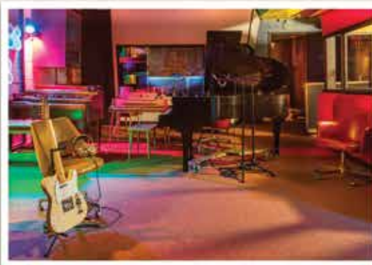
Muscle Shoals Sound Studio