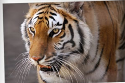
Students explore animal conservation, ecosystems, and zookeeping through EARTH Limited education programs at Southwick's Zoo