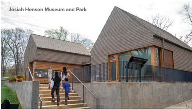
Josiah Henson Museum and Park