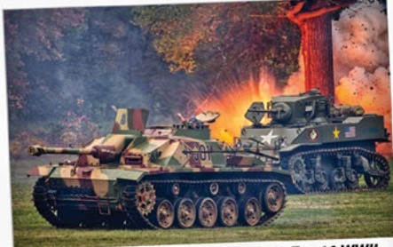
One of National Geographic's "World's Top 10 WWII Museums", the American Heritage Museum brings history to life through immersive exhibits

There has never been a better time to bring your students to Gettysburg, Pennsylvania. DestinationGettysburg.com