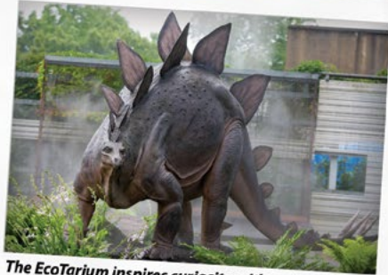
The EcoTarium inspires curiosity with nature trails, engaging lectures, and hands-on science programs spanning the environment to astrophysics