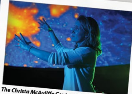
The Christa McAuliffe Center offers planetarium shows, astronomy lectures, and unique interactive space mission simulation programs