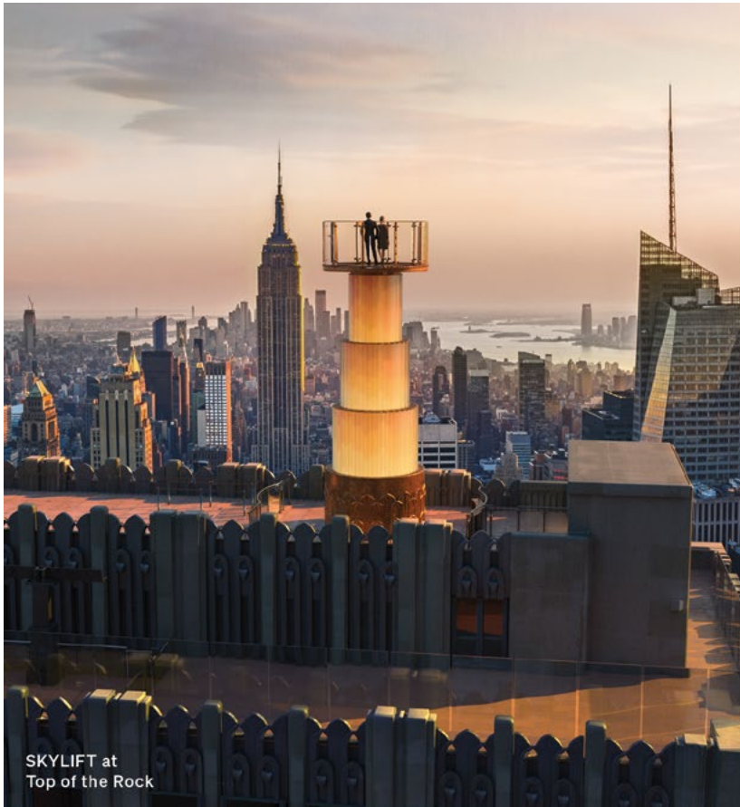
SKYLIFT at Top of the Rock